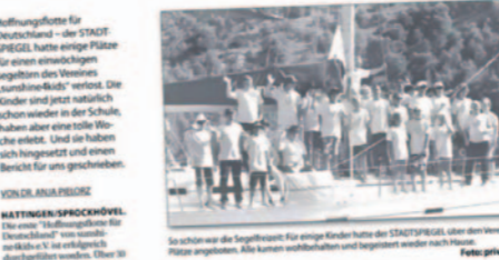
In schönem Wetter segelten für einige Kinder heute der STADTSPIEGEL über dem Wasser.

Der STADTSPIEGEL hatte einige Plätze für eine Segelfreizeit gemeinsam mit dem Verein zur Verfügung gestellt