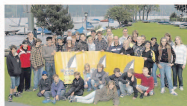
Wenig Sonnenschein, aber ein pralles Abenteuer-Programm erlebten die Kinder und Jugendlichen, hier am Yachtclubgelände in Bad Wiessee.