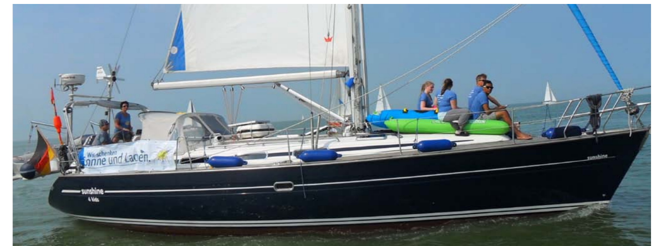
sunshine4Kids-Therapie Boote: Branding für 2014 noch nicht vergeben!

Participation is completely free of charge for the children. All accumulated costs will be covered by sunshine4kids Association and are furthermore financed by sponsors and other contributors.